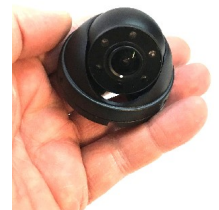
Compact Camera Code: CSP-406

Looks great on the front, side or rear any of vehicles